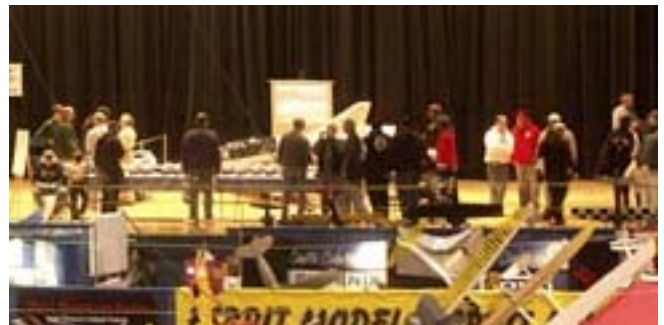
That's a full-scale BD5 on the stage at WRAM

"...stand behind the tall-grass barriers while flying"