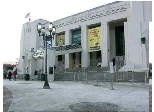
Entry to the 2005 WRAM Show

The bus left at 7:45 with 38 modelers aboard for the fantasy trip to 2005 WRAM Show. The aisles were packed with people. Vendors were showing their latest wares. Peter Heberer brought his camera along and shares his photos of the show with us. On stage was a full scale BD-5 that wasn't a lot bigger than some of the 3D planes modelers are flying. The owner/pilot was there to discuss it and admits to some white knuckle moments that led to a rebuild of the wings (originals flexed unnervingly) and removal of the Hirsch engine for rework to eliminate vibration and overheating on takeoff.