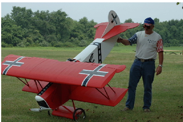
Balsa USA's 1/3rd scale Fokker D-VIII; It's BIG