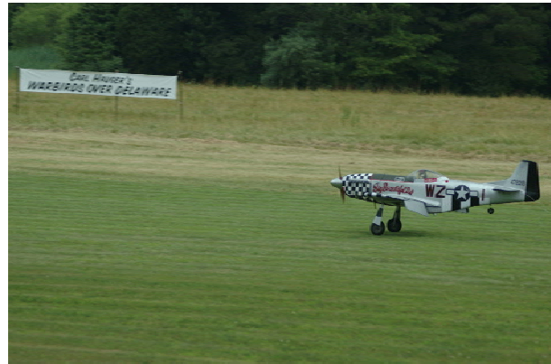
Dane Edward's P-51 lands in front of the event sign