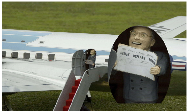
Truman in the door of The Independence