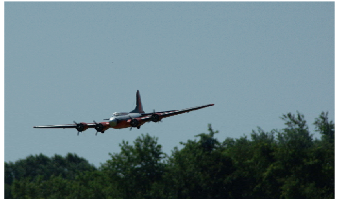
DC-6 "The Independence" by Carl Bachuber