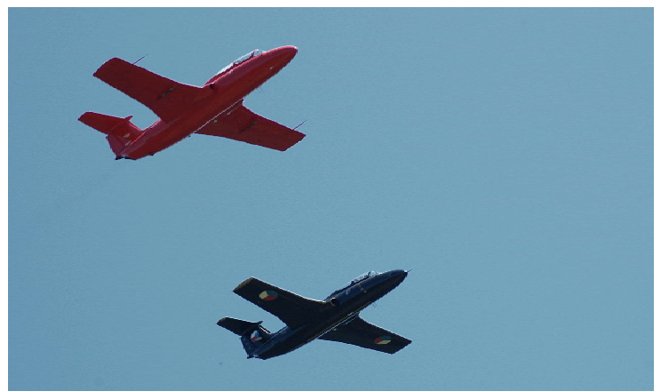
Fly-By of two L-29 Jets on Sunday