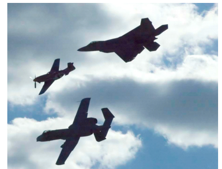
Heritage Flight P51 F22 A10

Come on in , bring your wallet and your dreams .