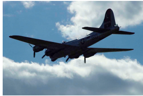
B-17 "Yankee Lady"