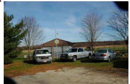
Wrapped up For Winter