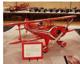
RICK BOYER - PITTS SPECIAL - Best in Show- 2004

Another big attraction of the show is the Swap Shop, to which mod-