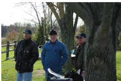
Our distinguished panel of experts.

Once again we are planning to go to the Northeast Mecca of Model Shows: the Westchester Radio Aero Modelers annual bash in White Plains, NY. Those who have been to the show need no introduction, but for the few who haven't experienced this palace of treats for the model enthusiast, let me try to explain.