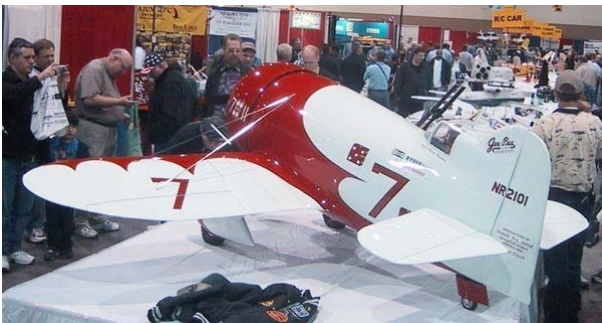
50% scale GEE BEE at Toledo