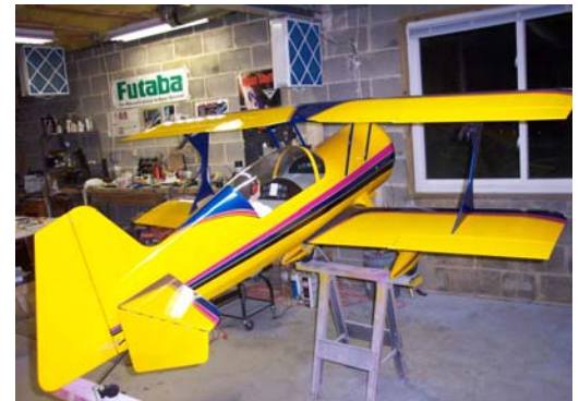
Matt Chapman's 35% Pitts S12 nears completion