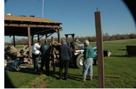
Work party gets it on!

We are off to a good start on field maintenance. I want to thank everyone for the outstanding job that was done. We now have our new fence up and it looks good. The roof on the pavilion has been replaced and the transmitter awning has been rebuilt and made longer. We have added 46 tons of stone to the entrance road and what a difference that has made. We even found time to clean up our pavilion and parking area. I want to personally thank everyone who came out to help with these large projects. You did a great job!