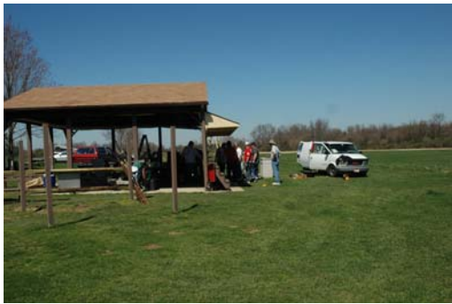
Finishing up on Sunday

And, if that was not enough, we even were able to fly Sunday afternoon. Now, when you go to the field, you will notice that most of those plastic chairs are gone. Please don't bring any more to the field and leave them there. If you want a chair at the field, get one that will fit in your car with your plane and take it home with you when you leave. The plastic chairs don't hold up and if a spectator was to sit in a broken one and fall and get hurt, we could be in for a law suit.