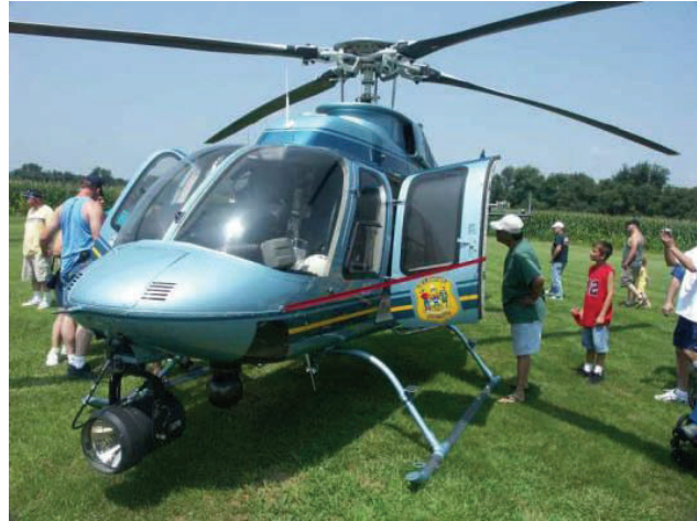
State Police helicopter at the Field, during Helis over Delaware '06