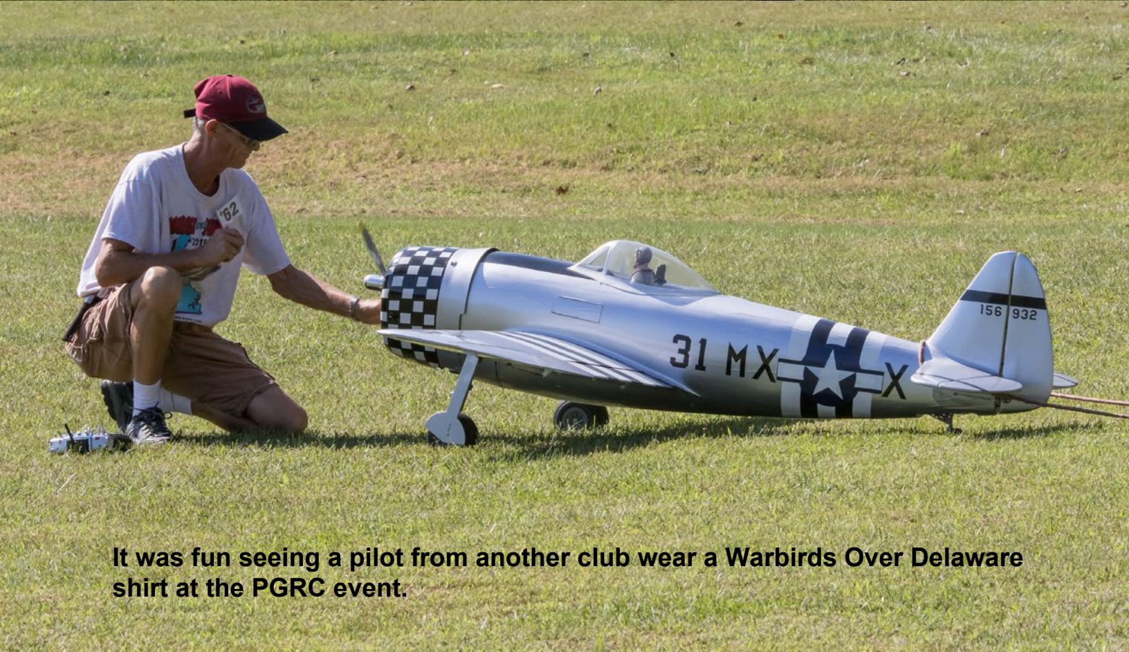
It was fun seeing a pilot from another club wear a Warbirds Over Delaware shirt at the PGRC event.